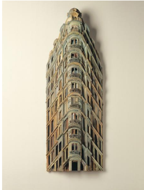
LEFT to RIGHT: Offering , 1988. Wood, oil, plaster, 41 x 22 x 9 inches. Private Collection; Old Building, Paris (for Sally) , 1988. Wood, wax, oil, plaster, 41 x 16 x 6 inches. Private Collection.